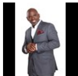
From the BCN Archives: Hear Me With Your Good Ear! Persistently Pursuing Your Passions On Purpose