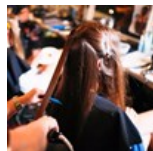
What Motivates Hair Dressers?